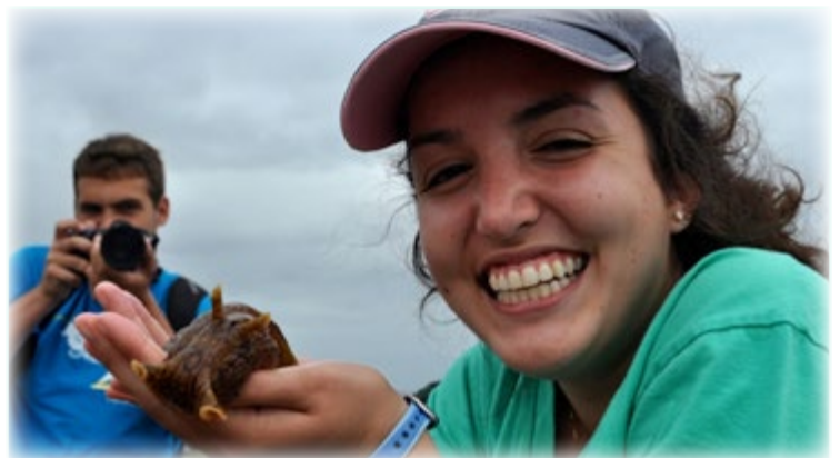
A Biology 3100 student enjoys her first encounter with a sea hare at Long Reef Marine Reserve near Sydney.

Students cementing live coral "fingers" to a rack, which will be positioned on a protected part of the reef. After each finger grows into a larger colony, the colonies can be transplanted to other areas of the coral reef (Mana Island, Fiji).