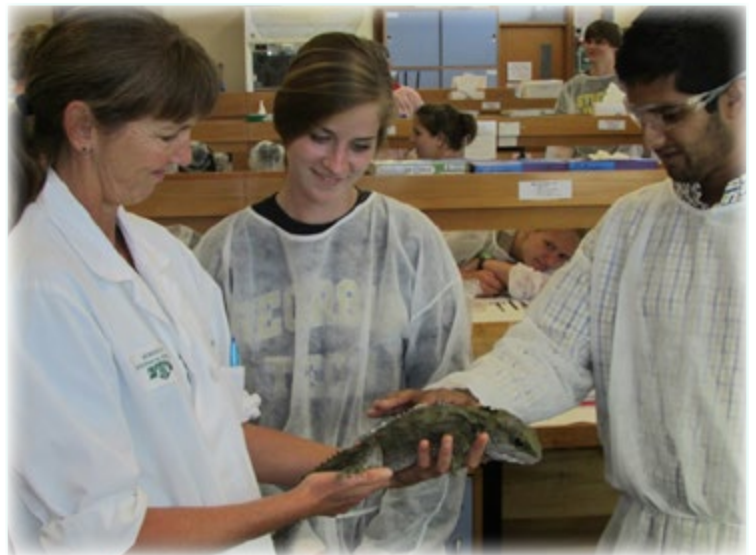
Biology 1520 students are introduced to a tuatara named Spike. Tuatara are the sole members of the reptile order Rhynchocephalia, found only in New Zealand. This has become an annual tradition in the program, as Spike is a youngster for a tuatara, being only 25 years old.

The program is open to students of all majors and includes a selection of courses (students must register for a minimum of 12 hours). Three Biology courses are included in the program: Biology 1520