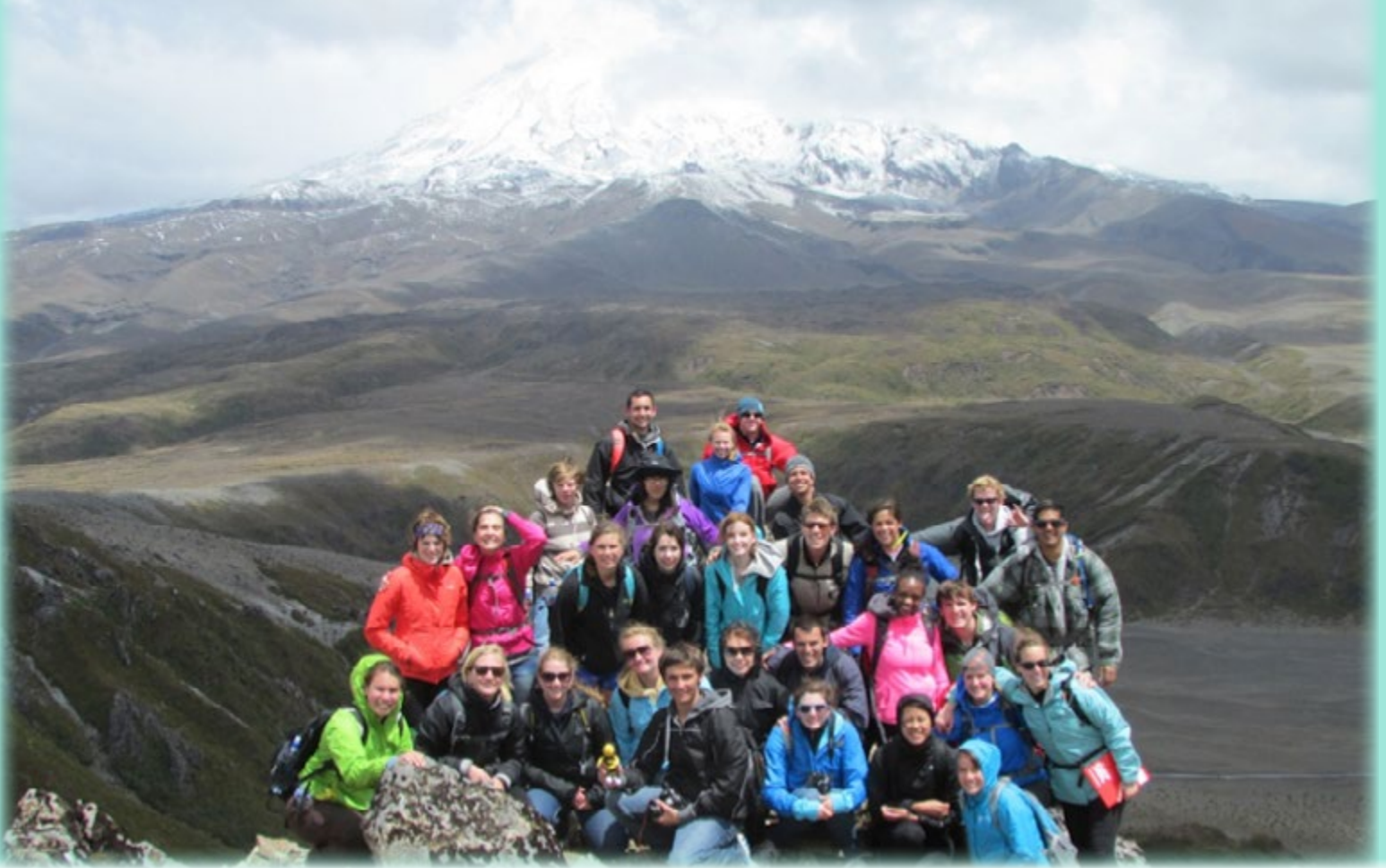
Group photo, Biology 2100 field trip to Tongariro National Park. Mt. Ruapehu, a snow-capped volcano, is in the background. Students observed the volcanic features of this park, as well as vegetation zonation from temperate rainforest to tundra, during the 12-mile hike.