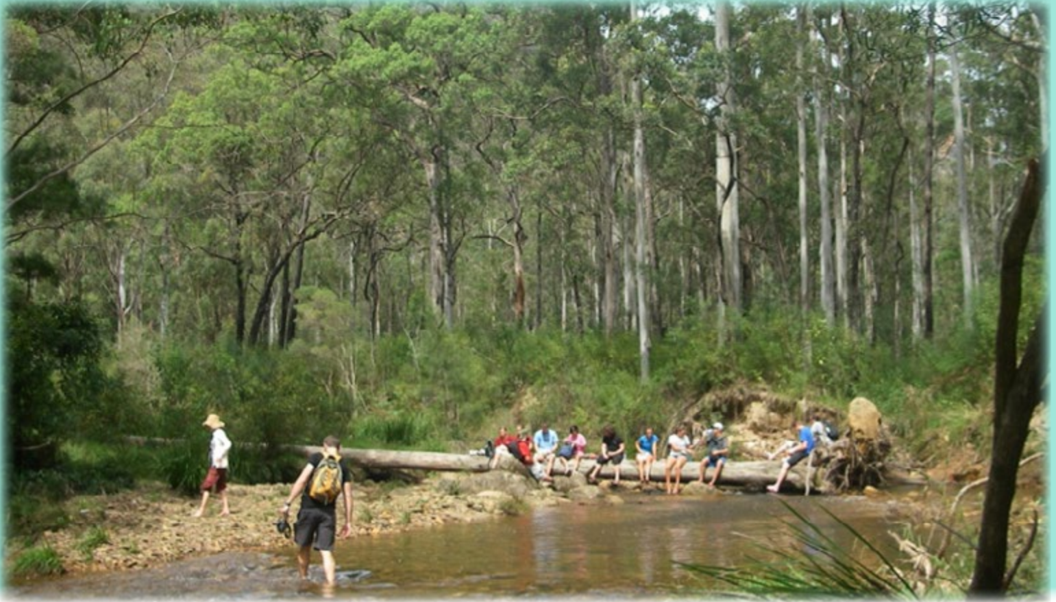
Lunch break during a field trip in the Blue Gum Forest, Blue Mountains National Park, New South Wales, Australia. This is a well-protected example of Australia's famous eucalyptus forests, with clear-flowing streams and picturesque red sandstone cliffs.

(Introductory Organismal Biology), Biology 2100 (Island Biogeography of New Zealand) and Biology 3100 (Ecology & Evolution: An Australian Perspective). The Biology courses capitalize on the unique features of each country. New Zealand is a remote collection of oceanic islands with the highest level of endemism in the world; Australia is renowned for its marsupial mammals and also offers a remarkable diversity of terrestrial and marine ecosystems; Fiji illustrates the influence and importance of coral reef systems to indigenous populations and serves as an example of the challenges involved in protecting rare or threatened ecosystems. Students in the Biology courses gain experience from multiple field trips and complete independent research projects at spectacular sites.